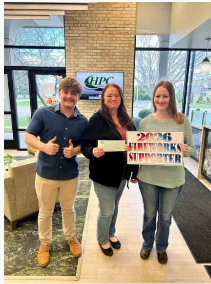
We are happy to support Alpena Fireworks for the 2026 show by contributing to their $500 business challenge!