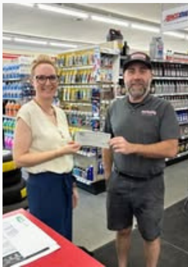
We are happy to support Mio Fireworks for the 2026 show by contributing $1,000!