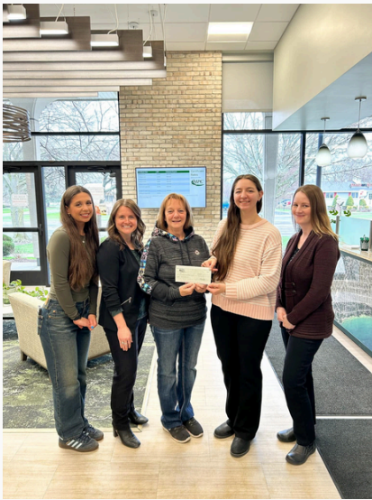
We are happy to support this years 2026 Alpena County Fair by donating $2,500 to the event!