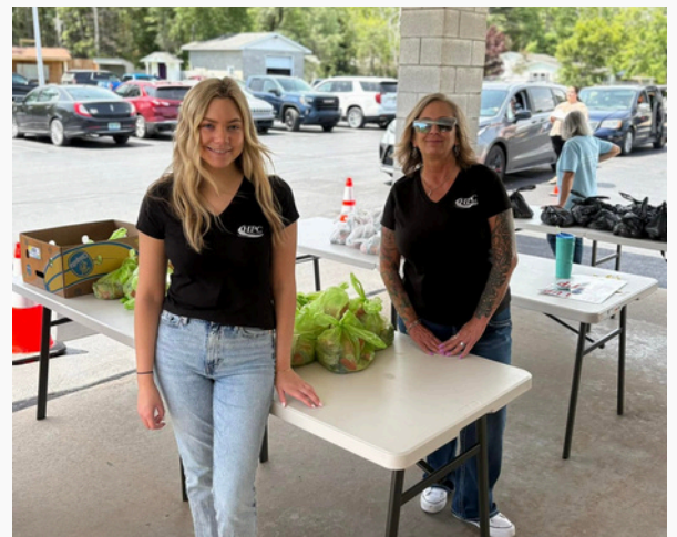
Passing out food for the Summer Food Service Program!