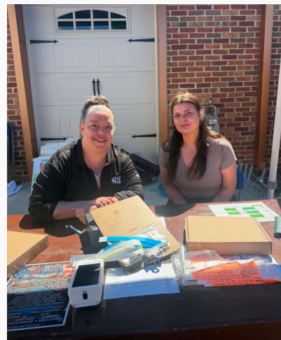
Volunteering at Red, White and Blue Collar Festival!