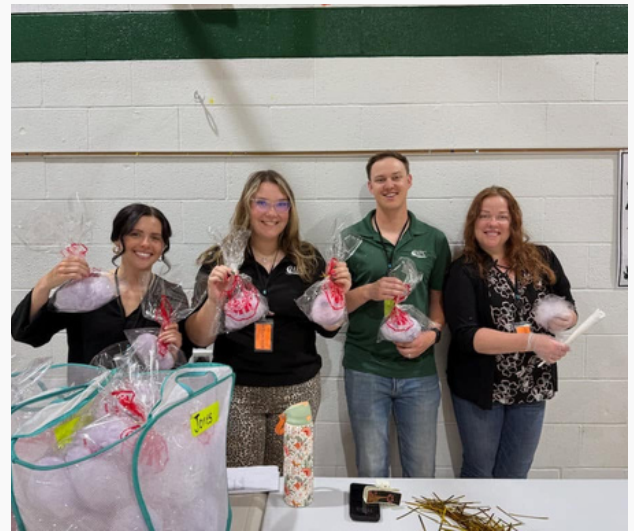
Making cotton candy for students!